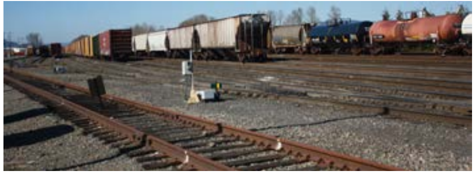
Longview Switching Yard

20 years ago as a switchman and served as a yardmaster and locomotive engineer before taking his current role. He enjoys the multitude of personalities he encounters each day.