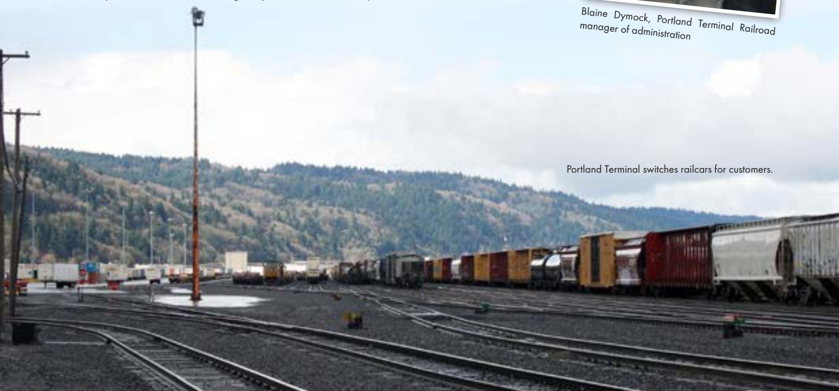
Portland Terminal switches railcars for customers.