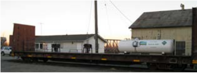
The CCT HazMat Training prop car