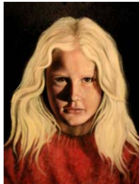
One of Dyer's favorite paintings, "Ice," shows a young blonde girl from Iceland with eyes that have an icy glaze.